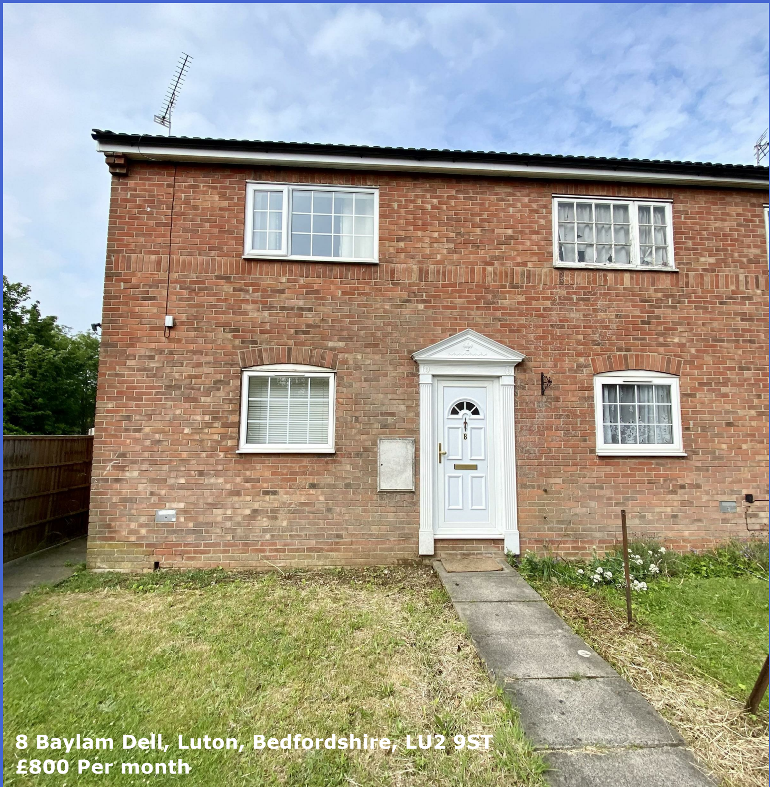
8 Baylam Dell, Luton, Bedfordshire, LU2 9ST £800 Per month